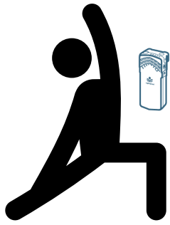
Instructor with Redcat mic ("flexmic")