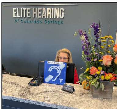
Elite Hearing of Colorado Springs Colorado Springs, CO