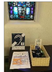
First Congregational Church, Boulder, CO