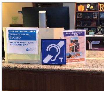
Danville Library Danville, CA