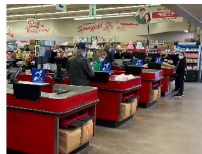
Grocery Outlet Springfield, OR