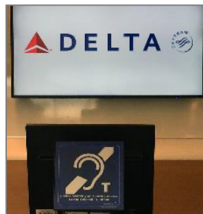
Detroit Metro Airport Detroit, MI