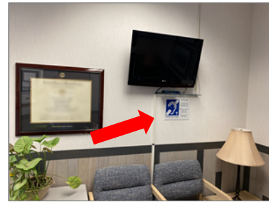
Fox Valley Hearing Center, Oshkosh, WI

5. Google Local Guide. By uploading photos and reviews, you become part of a global community of explorers who write reviews, share photos, answer questions, add or edit places, and check facts on Google Maps. Millions of people rely on contributions like yours to decide where to go and what to do.