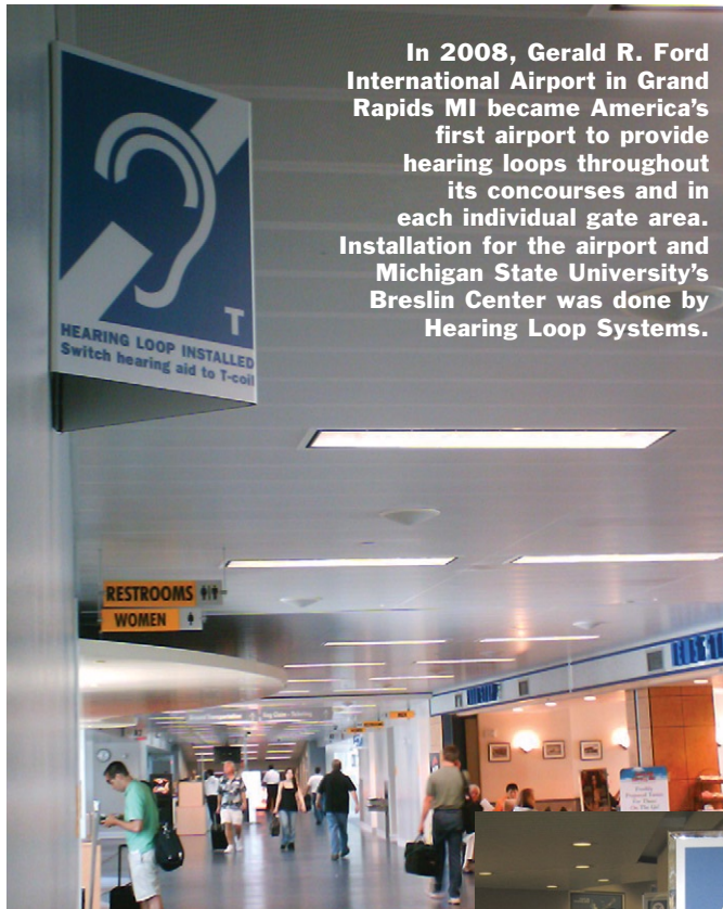
In 2008, Gerald R. Ford International Airport in Grand Rapids MI became America's first airport to provide hearing loops throughout its concourses and in each individual gate area. Installation for the airport and Michigan State University's Breslin Center was done by Hearing Loop Systems.

noise. Hearing loops take the desired speech signal straight from the basic source (the microphone) and broadcast directly to the listener's hearing aid(s). The signal at the listener's ears is free from distance issues, reverberation and ambient noise interference.