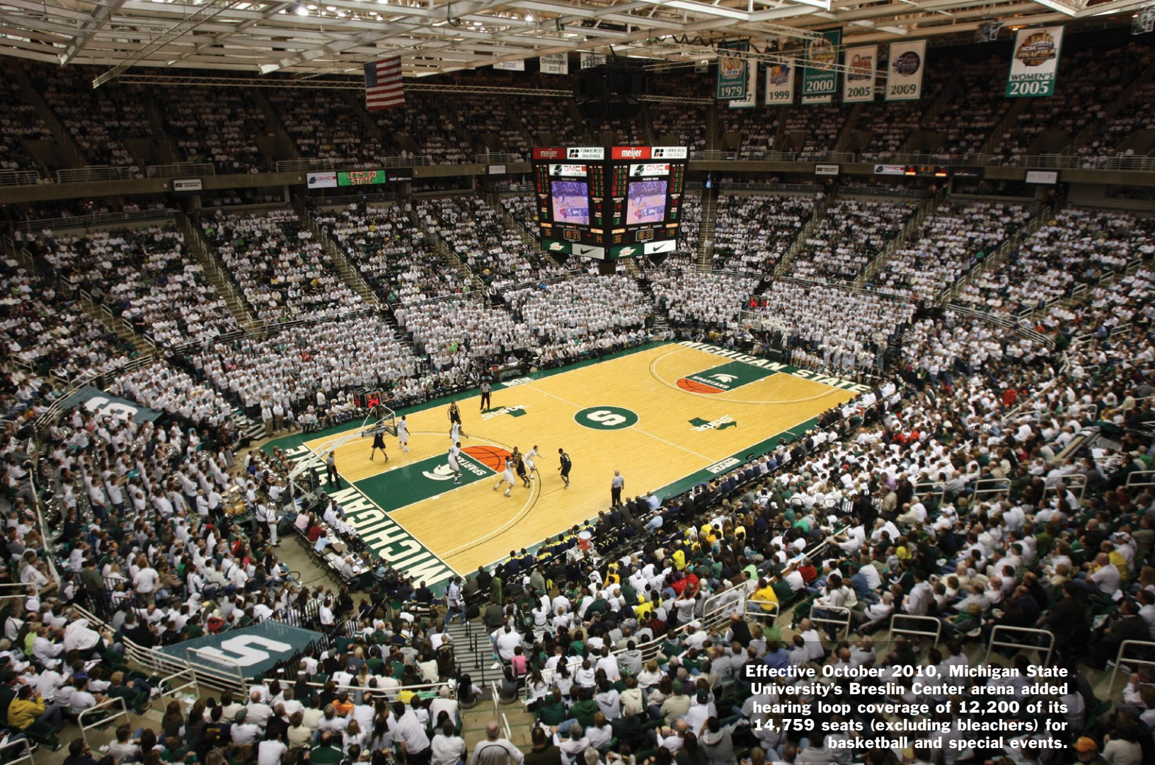
Effective October 2010, Michigan State University's Breslin Center arena added hearing loop coverage of 12,200 of its 14,759 seats (excluding bleachers) for basketball and special events.